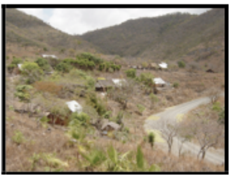
Some families could not stand the conditions and returned to the river. View of the Panquix community.