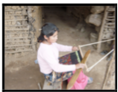
Dionisia Sis Izaguirre, like other women, makes huipiles..