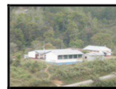
The community's struggles and work has allowed them to improve infrastructure like the church and school.