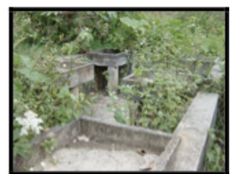
The pila built by INDE was not useful.