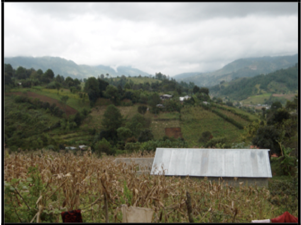
View of San Antonio Panec Community