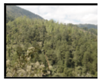
There is still a small forest for lumber.