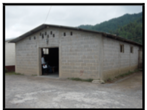
The community hall's roof is deteriorating. INDE did not fulfill its promises.