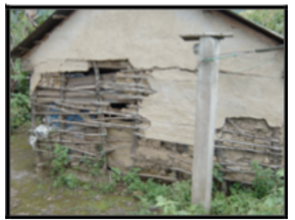
The INDE built houses are deteriorating. Mr. Santos Sucup's house.

Seventy-five families currently live in the community. Thirty-three were included in the INDE census and 42 are new families (the sons and daughters of the evicted families).