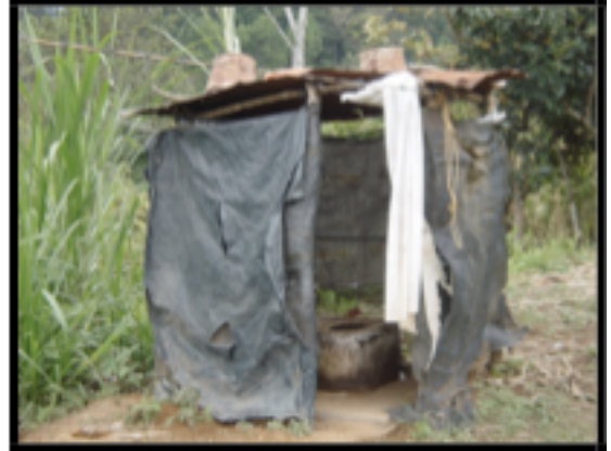
The few latrines built with INDE support are in terrible shape. Mr. Rodrigo Sucup's latrine.