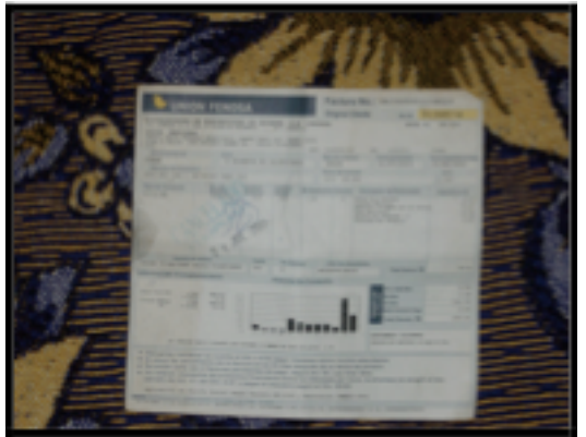
The price of electricity is too high. Herlinda Sucup, with a 30 day fine, must pay Q 225.