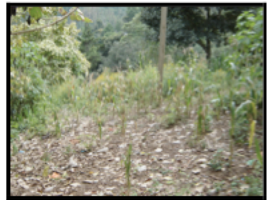
Dry cornfield: When there are no resources to purchase fertilizer, harvests are not possible on the land.