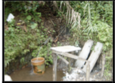
Five families share a well during the summer months when water is scarce.