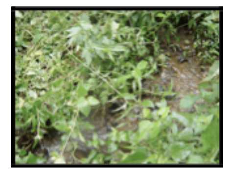
In the summer, six families have to carry water from the river.