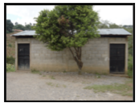
FONAPAZ supported with the purchase of the school's stove.